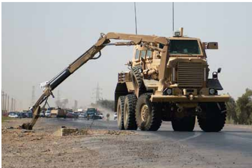
A heavily armored vehicle known as the Buffalo searches for improvised explosive devices during Operation IRAQI FREEDOM.