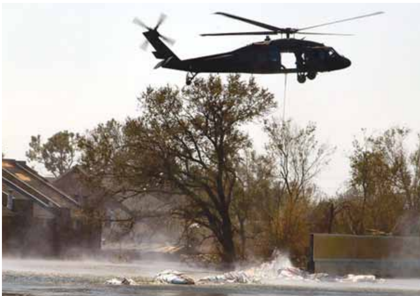
A UH-60 Black Hawk helicopter drops a 7,500-pound sandbag over a breached levee caused by Hurricane Katrina.

installation management took a significant step toward reducing waste at installations. One change mandated as a contract performance requirement was that future construction contracts would require recycling or salvage of at least 50 percent of construction and demolition debris. The Army generated 1.4 million tons of debris in 2004 and could deconstruct such materials as wood beams, metals, and concrete masonry for reuse in other projects.