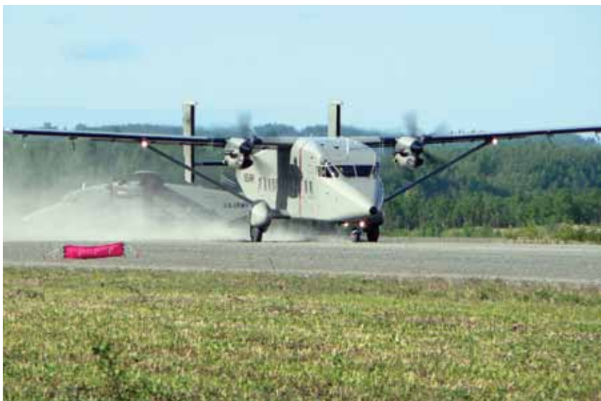
A C-23 Sherpa

The Army National Guard's Operational Support Airlift Agency controlled 114 Army Guard fixed-wing aircraft at eighty sites, with the C-23 Sherpa proving the workhorse in supporting domestic and overseas missions.