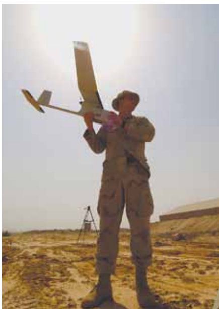
A soldier prepares to launch an unmanned aerial vehicle.

await production of all elements in an integrated unit fielding package. By 2006, the Army goal was to “spin out” these new technologies in four increments at approximately two-year intervals.