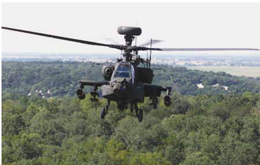
An AH-64D Longbow Apache helicopter

If the Future Combat Systems remained in the research and development phases of modernization, several aviation programs were adding new aircraft to the force. Deliveries of AH-64D Longbow Apache helicopters to the active component were reaching completion, with deliveries to the reserve components coming next. Planned deliveries of the CH-47F Chinook should begin in 2007. The UH-60M Black Hawk helicopter would enter the force a year later. Upgrading and rebuilding of AH-64, CH-47, and UH-60 helicopters, already in the force, continued. The rebuilt aircraft in effect would perform at the same operational readiness levels as relatively new aircraft.