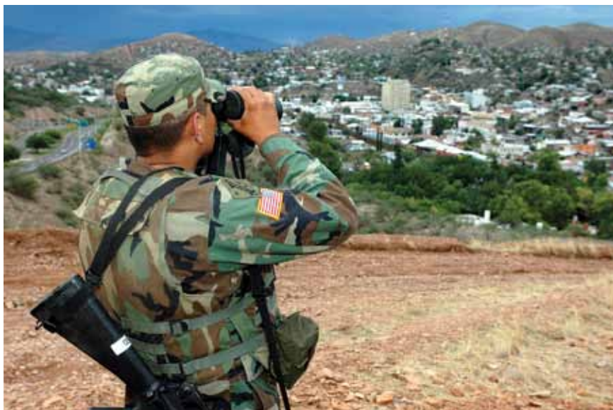
An Arizona Army National Guard soldier stands watch on the U.S.-Mexico border in support of Operation JUMP START.

JUMP START. By the end of September, 5,252 guardsmen from forty-one states had served on the border either in an annual training status or on active duty for special work. Among other contributions, these soldiers helped apprehend 11,265 aliens; seize 184 vehicles; seize 39,733 pounds of illegal drugs; construct 27.9 miles of roads; install 4.2 miles of fencing and 32.7 miles of vehicle barriers; and construct two forward-operating bases, one in Yuma, Arizona, and the other in Deming, New Mexico, each base housing and sustaining 700 soldiers.