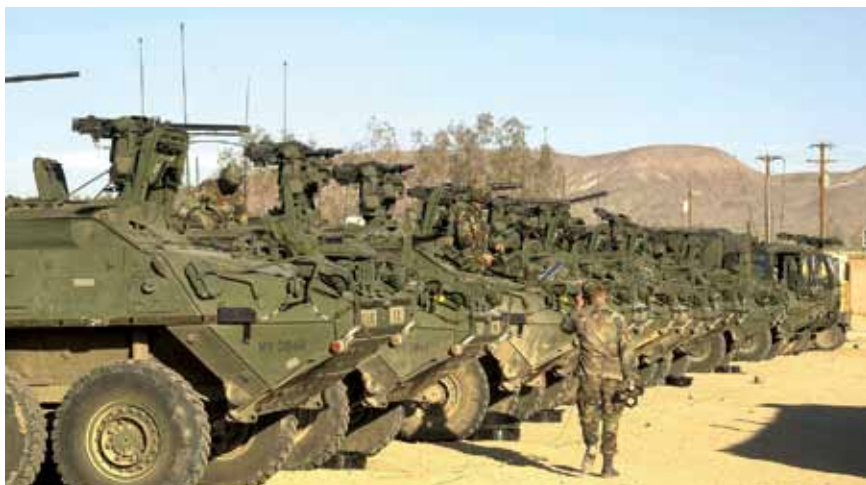
U.S. Army soldiers conduct pre-combat checks on Stryker vehicles at the National Training Center, Fort Irwin, California.