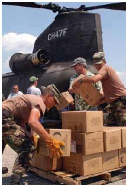
Army National Guard soldiers participate in relief operations during the aftermath of Hurricane Katrina.

Despite this handicap, modernization of aviation forces continued during the year. In addition, all eight division aviation brigades completed the transition to modular designs. The Army Guard also received fourteen UH-60 utility helicopters from the active Army, raising the National Guard inventory to 633 out of a required force of 758. The National Guard's CH-47 force also remained understrength, with 132 out of 159 required. The inventory of AH-64 helicopters increased by three during the year to 154 out of 222 required. Five OH-58D helicopters also joined the National Guard during the year, increasing the inventory to 23 out of 30 required. The air fixed-wing fleet remained steady with no gains or losses during the year.