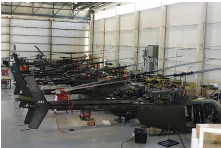
OH-58A Kiowa helicopters await overhaul and upgrade at the Mississippi Army National Guard's repair depot in Gulfport.

Command coordinated a program of inspection, repair, and overhaul of helicopters and fixed-wing aircraft at fourteen sites in the United States and Germany. Restoration of each aircraft to combat capability proved the first hurdle, often requiring overhaul of engines and rotor blades from damage resulting from desert environments with fine sand and extreme heat conditions. The larger objective required returning each airframe to as close in capability as a new one, without any degradation in capability due to wear. Based on the degree of rehabilitation or modernization sought, the amount of time required for an airframe took between 34 and more than 200 days.