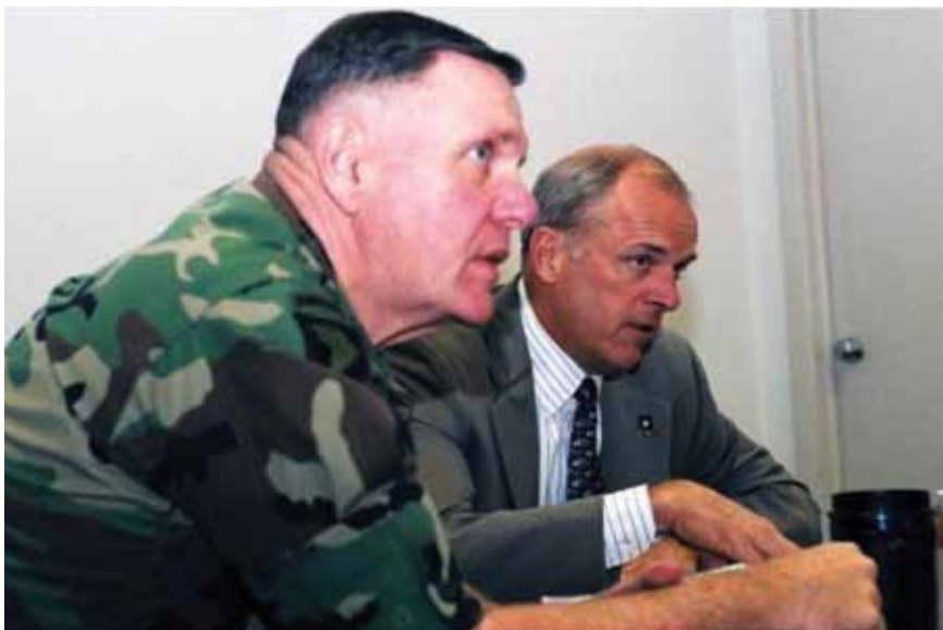
General Keane, left, and Secretary White, 13 September 2001

Following the plane's crash, almost all Department of the Army personnel evacuated the building, most heading for the parking lots or the courtyard in the center of the Pentagon. The Army Operations Center remained manned throughout the attack and its aftermath, and Secretary White and General Keane made their ways there to provide leadership and guidance. The vice