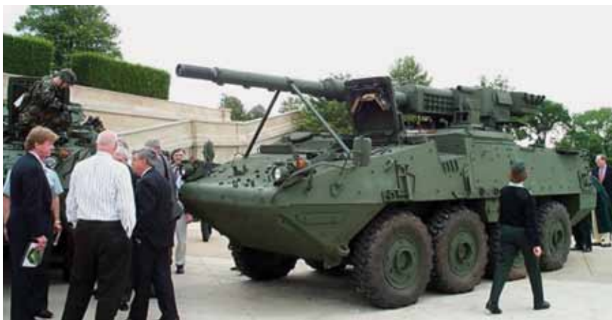
Mobile Gun System variant of the Interim Armored Vehicle

The contract with GM GDLS Defense Group called for the construction of 2,131 vehicles over a six-year period at a cost of $4 billion, with initial delivery to begin in 2001. This first delivery would consist of more than three hundred vehicles, enough to outfit one of the brigades at Fort Lewis. The contract called for enough vehicles to equip the six Initial Brigade Combat Teams by FY 2006. A competing firm filed a protest against the contract shortly after it was made public, causing a delay of almost four months. On 9 April 2001, the Government Accountability Office rejected the protest and upheld the award to GM GDLS Defense Group.