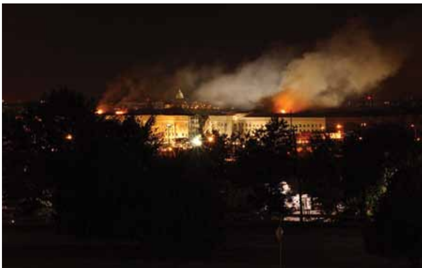
The Pentagon burning at night

chief of staff sent messages throughout the Army to inform subordinate commands that HQDA was still directing operations. Amid the hectic activity and confusion, the Army Operations Center staff removed Secretary White, despite his objection, to a remote location. Later, the staff realized that his relocation had not been required by the situation in accordance with contingency plans. The evacuation of Secretary White left General Keane in charge at the Pentagon for the remainder of the day.