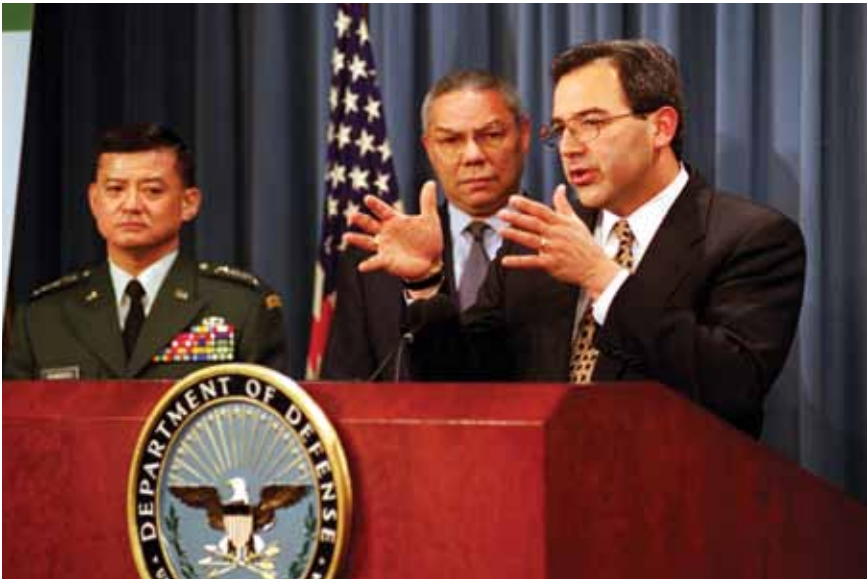
From right, Secretary Caldera, with General Colin L. Powell (USA, Ret.) and General Shinseki, announces the College First and General Education Development Diploma Plus initiatives, 3 February 2000.

soldiers to earn postsecondary degrees and technical certifications through Internet instruction between fiscal years 2001–2006.