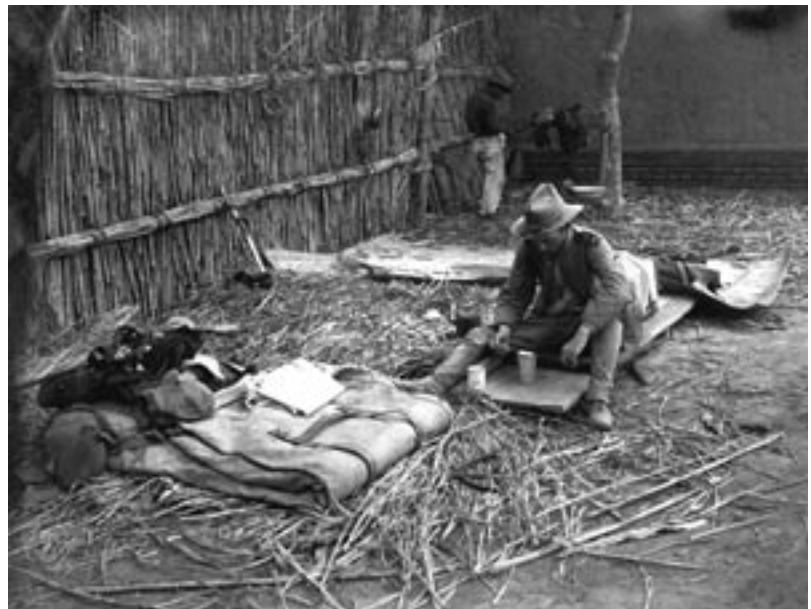
Typical Officer's Sleeping Quarters in China, ca. 1900

Although the McKinley administration disliked the idea of becoming involved in foreign alliances, it agreed to join with the other powers (Britain, France, Germany, Russia, Austria-Hungary, Italy, and Japan) to rescue their beleaguered nationals. About 100 U.S. marines joined a 2,100-man international force under British Admiral Sir Edward