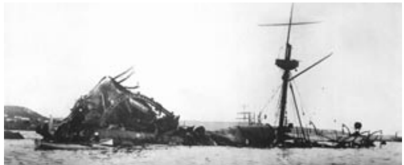
Wreck of the Maine, 1898

Despite mounting public pressure, Cleveland's successor as President, William McKinley, also tried to avoid war with Spain. He might