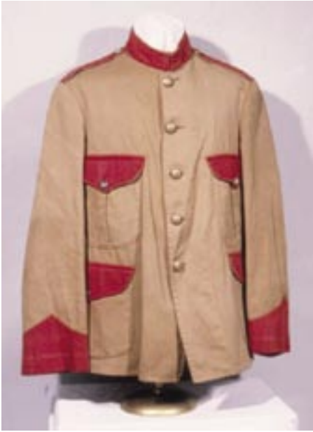
A Pennsylvania artilleryman would wear a khaki cotton field coat such as this.

The Navy began to actively prepare for war in January 1898, and in late February Theodore Roosevelt, as Acting Secretary of the Navy (Secretary John D. Long was ailing), cabled orders to American naval commanders, instructing them to get their squadrons in readiness for action. Commodore George Dewey of the Asiatic Squadron responded by assembling his ships at Hong Kong, where they could take on coal and supplies preparatory to an attack on the Philippines. Thus, on April 24, when McKinley finally ordered the Asiatic Squadron to initiate hostilities, Dewey was ready. He sailed into Manila Bay on the night of April 30 and the following morning located Spain's weak and dilapidated naval squadron at Cavite. In a few hours and without loss of a single American life, he sank or disabled the entire Spanish force. In the days immediately following, he also silenced the land batteries defending Manila harbor; but the city itself continued to resist. With barely enough men to maintain his own squadron, Dewey requested the dispatch of land forces from the United States to help take Manila.