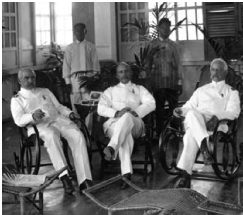
General Otis’ Staff and Assistants in Their Quarters in Manila, 1899

In February 1899 Aguinaldo’s Army of Liberation of the Philippines had arrayed up to 40,000 men around Manila with additional detachments of militia distributed throughout the archipelago. Orga-